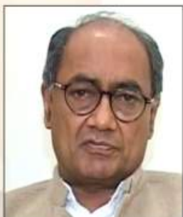
Hon. Digvijaya Singh AICC General Secretary & Trust Member

The Hindupat Institute of Teacher Training, our newest venture, was founded to improve the quality of teachers in India, especially in the rural areas. Our vision is to train teachers with global best practices through partnerships with global institutions and universities. In turn, the youth of tomorrow will receive the best education possible.