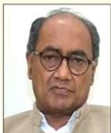
Hon. Digvijaya Singh AICC General secretary